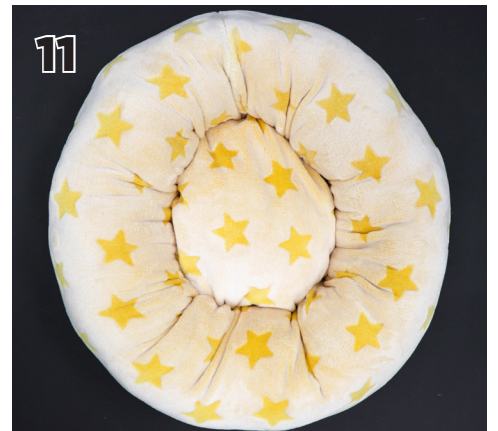
11. Fluff your bed, close the zipper and watch your pet climb into comfort!