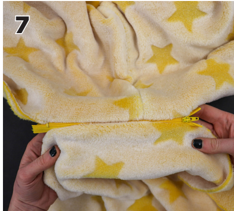
7. Stitch the other side of the zipper to the 20" circle.