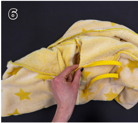
6. Stitch one side of the zipper to the tube and rectangle that were just basted.