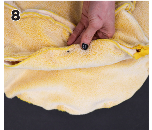
8. Stitch the rest of the 20" circle to the rectangle.