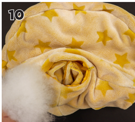
10. Stuff your bed. Because of the construction, of the bed, you can stuff the tube and main bed separately.