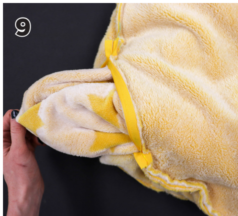
9. Turn the bed right side out through the zipper opening.