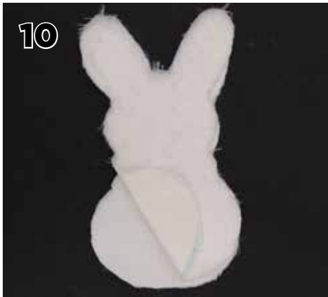
10. Using the pattern provided cut out 2 bunnies from the chenille. Place wrong sides together and stitch around leaving a 3" opening at the bottom.