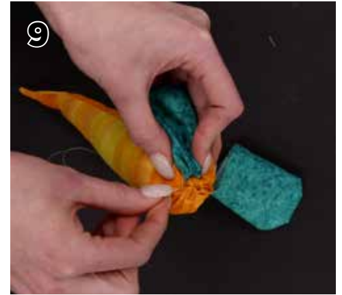
9. Tie a knot at the end of your thread and hand stitch a gathering stitch to the opening of the leaf, stitching through both layers. Attach to the top of the carrot. Repeat with the second leaf.