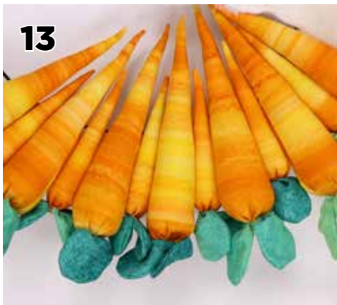
13. Glue the bunny onto the metal wreath frame. Glue the carrots onto the frame, alternating between small and large.