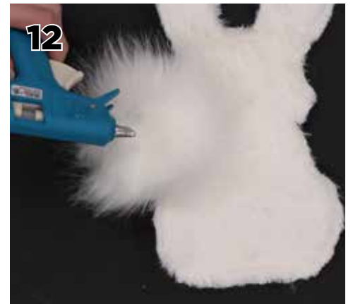
12. Using hot glue, glue the faux fur pom pom onto the bunny.