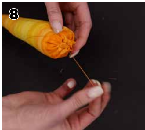
8. Tie a knot at the end of your thread and hand stitch a gathering stitch to the top of the carrot. Pull tight to close the carrot. Stitch the edge closed and secure with a knot.