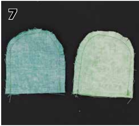
7. Trim and snip the curves. Turn right side out.