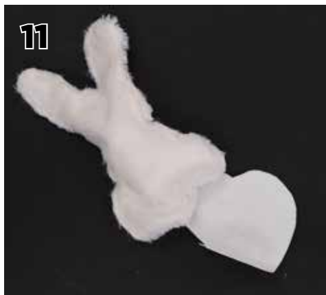
11 Trim the seam allowance from the pattern and use it to cut out the craft fusing. Trim the craft fusing to fit the bunny. Stuff the craft fusing into the opening. Stitch the opening closed.