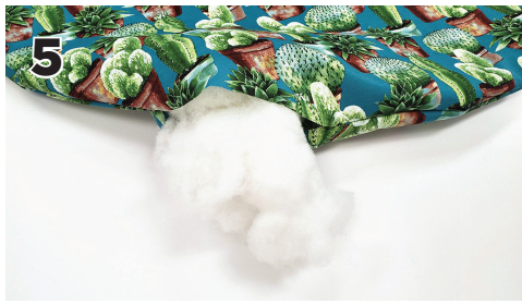
5. Stuff with polyfill.