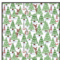
Fabric B Trees - White