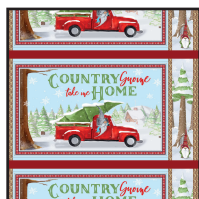
Fabric E Red Truck Panel - Lt. Blue