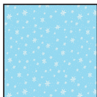
Fabric A Snowflakes - Lt. Blue