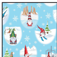
Fabric C Gnome Vignettes - Lt. Blue