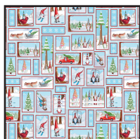
Fabric D Patch - Lt. Blue